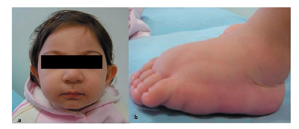
Figure 1. Case 1: (a) characteristic facial features; (b) lymphedema.

plaint of microcephaly. He was the second child of healthy nonconsanguineous parents. His mother had uterine bleeding at 24 weeks' gestation. The ultrasound examination showed intrauterine growth retardation and placental blood flow was reduced. The mother had used acetylsalicylic acid and subcutaneous low molecular weight heparin after 24 weeks of gestation.