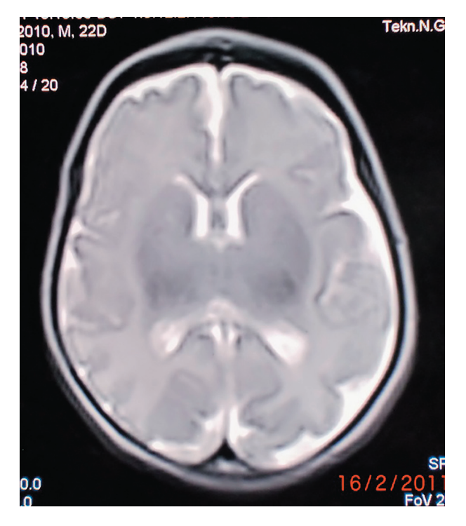
Figure 3. Case 2: MRG showed microcephaly and microlissencephaly.

variable expressions of the same entity. Ostergaard et al [8] analyzed the KIF11 gene in unrelated chorioretinal dysplasia, microcephaly and mental retardation syndrome (CDMMR) and MLCRD syndrome families identified heterozygous mutations in KIF11 gene. It was concluded that the MLCRD and CDMMR syndromes should be considered a single entity with variable clinical features. They can be observed as an auto-somal dominant disorder with variable expressivity, mainly characterized by mild to severe microcephaly, often associated with developmental delay, ocular defects and lymphedema, essentially on the dorsum of the feet [10].