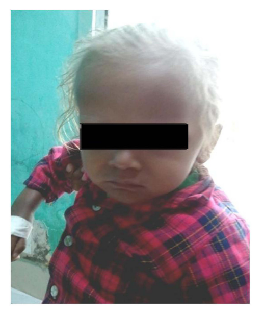
Figure 1. Physical appearance of patient showing silvery grey hair and light colored skin.

syndrome type 2 is caused by mutation in RAB 27A gene. RAB 27A gene encodes the small GTPase protein Rab27a. Rab27a is associated with melanosomes in pigment cells and regulates melanosome transport via its interaction with actin based cellular motors such as myosin-Va and myosin V11a. Myosin-Va and myosin V11a do not interact directly with Rab27a but require linker proteins, melanophilin and myrip respectively. RAB27A gene mutation results in pigmentary dilution of skin and hair, the presence of large clumps of pigment in hair shafts, and an accumulation of melanosomes in melanocytes. Rab27a is also required for secretion of lytic granules in cytotoxic T lymphocytes. In RAB27A gene mutation, capacity of the lymphocytes and NK cells to lyse target cells is impaired or absent which results in primary immunodeficiency. Griscelli syndrome type 2 patients also develop an uncontrolled T-lymphocyte and macrophage activation syndrome, known as hemophagocytic lymhohistiocytosis (HLH). Hemophagocytic lymphohistocytosis has been characterized by an unremitting polyclonal CD8+ T cell expansion, and lymphocytic infiltration of visceral tis-