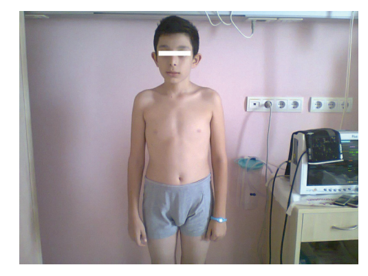
Figure 1. Features of patient.