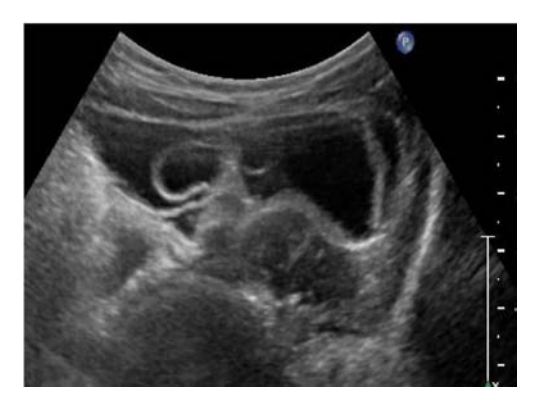
Figure 3. Intraabdominal cystic mass with internal septations in patient 2.