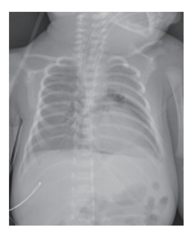
Figure 3. Partially resorbed PPC.

was 2 s, and arterial blood pressure was 59/36 mm Hg (between 50th and 95th percentile of the normal limits based on gestational age). Initial chest X-ray was consistent with mild RDS; however, since retractions and grunting receded gradually and the patient was stable on 6 cm H<sub>2</sub>O CPAP with FiO<sub>2</sub> of 25%, she was not given surfactant.