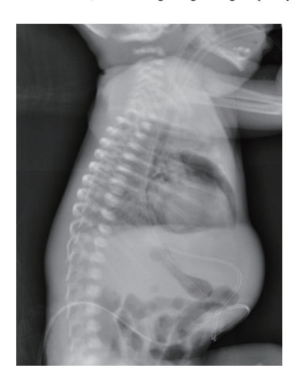
Figure 2. Lateral view of PPC.

The vital parameters upon admission to NICU showed a heart rate of 156 beats/min, respiratory rate of 68/min with intercostal retractions, nasal flaring and grunting. Capillary refill