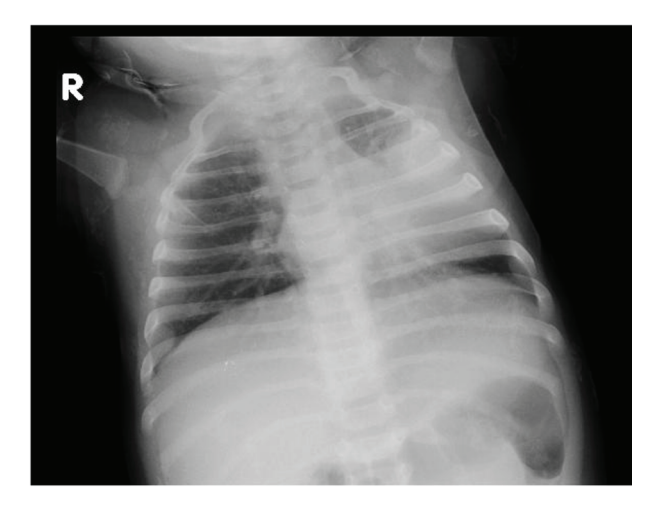
Figure 1. Hilar and lower left lung condensation.

On physical exam, the infant was tonic and reactive, and showed no cervical, axillar or inguinal lymph nodes, no wheezing, and no hepatosplenomegaly. There were no signs of respiratory distress. All lab tests were normal. Mantoux skin test (5TU PPD) was positive and showed local induration of 20 mm with erythema. A chest radiography revealed parahilar and left lower lobe lung condensation (Fig. 1). Pulmonary computed tomography showed large left hilar lymphadenopathy, with central necrosis and multiple mediastinal lymph nodes in the paratracheobronchial region < 12 mm in