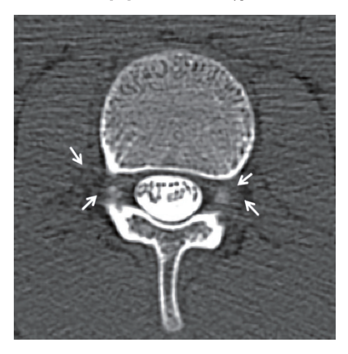
Figure 2. Postmyelography contrast computed tomography (CT). Axial CT showing bilateral extrathecal cerebrospinal fluid collections (arrows).

Patients with both CSF hypovolemia and OD present with orthostatic headache [12]. Moreover, CSF hypovolemia and OD