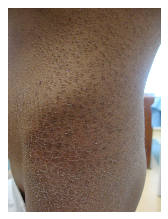
Figure 1. Common ichthyosis in whole body.

cohols in the skin and myelin of the central nervous system. The ichthyosis in SLS has characteristic appearance with its prominent generalized hyperkeratosis and remarkable brownish yellow color and is prominent in the flexure areas, nape of the neck, trunk and extremities. All patients also suffer from severe pruritus like our patient. The presence of pruritus in SLS contrast with other icthyotic skin disorders, which are generally non-icthing [4]. Although it is usually the presenting symptom of patients, ichthyosis might be in the 23th week of gestation prenatally [5, 6].